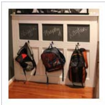
Build Organization With Backpack Central