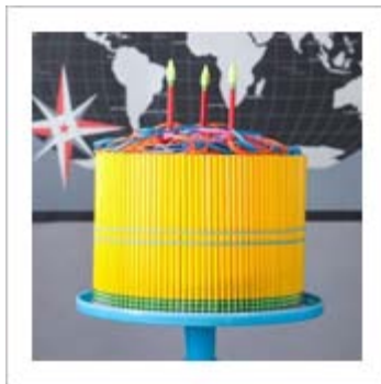
Pencil "Cake" Makes A Sharp Decoration