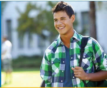
College Scholarship Program

NEMR Telecom is pleased to announce our continued participation in the Foundation for Rural Services (FRS) Scholarship Program. FRS awards a one-time $2,500 scholarship to students from rural America for their first year of college, university or vocational-technical school. Should a 857-4445 student from our service area be selected to receive one of the scholarships ($2,000 each), we will contribute an additional $500 to the scholarship, bringing the total one-time scholarship award to $2,500. The FRS College Scholarship Program seeks to encourage students to return to their rural communities upon completing their education.